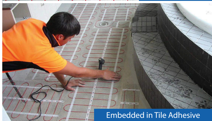
Embedded in Tile Adhesive