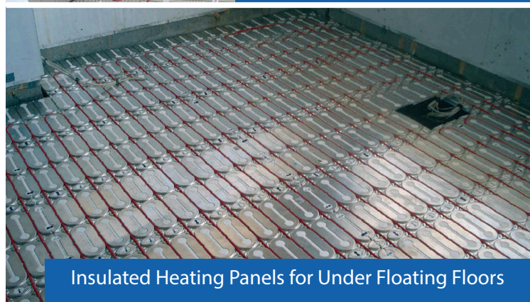
Insulated Heating Panels for Under Floating Floors